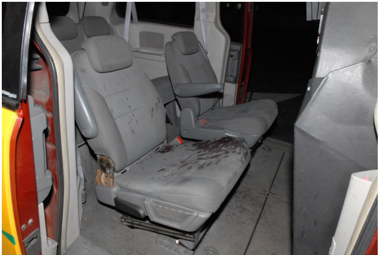
Bloody Seat from Cab

For more information please contact the Albany County District Attorney's Office at AlbanyDA@albanycountyny.gov