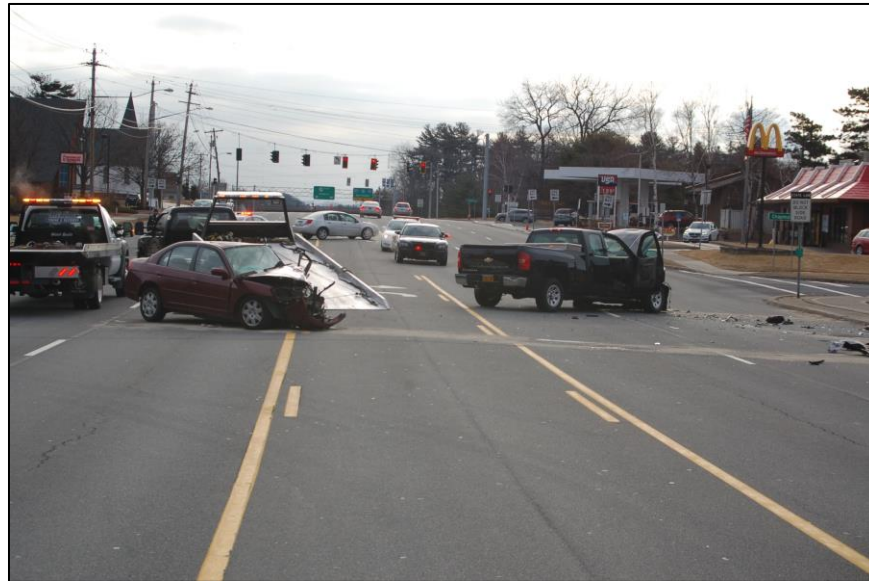
Crash scene on Western Ave. in Guilderland on February 27, 2016

For more information, please contact Cecilia Walsh (518) 275-4710 or cecilia.walsh@albanycounty.com .