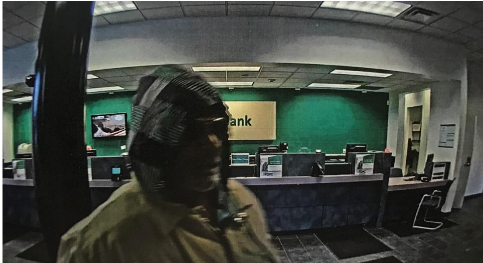
PRICE captured on video surveillance during the bank robbery

For more information please contact Cecilia Walsh at (518) 275-4710 or cecilia.walsh@albanycountyny.gov