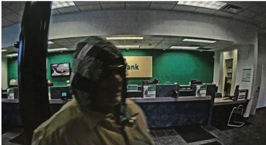
PRICE captured on video surveillance during the bank robbery

For more information please contact Cecilia Walsh at (518) 275-4710 or cecilia.walsh@albanycountyny.gov