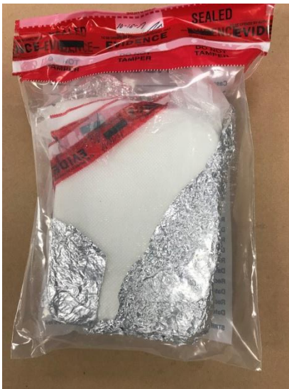
1.5 kilos of Cocaine

For more information please contact the Albany County District Attorney's Office at AlbanyDA@albanycountyny.gov .