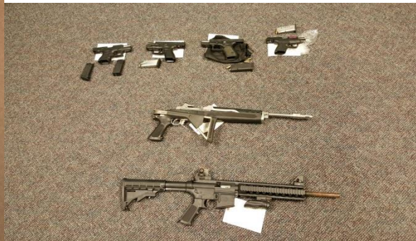
Handguns and Assault Rifles