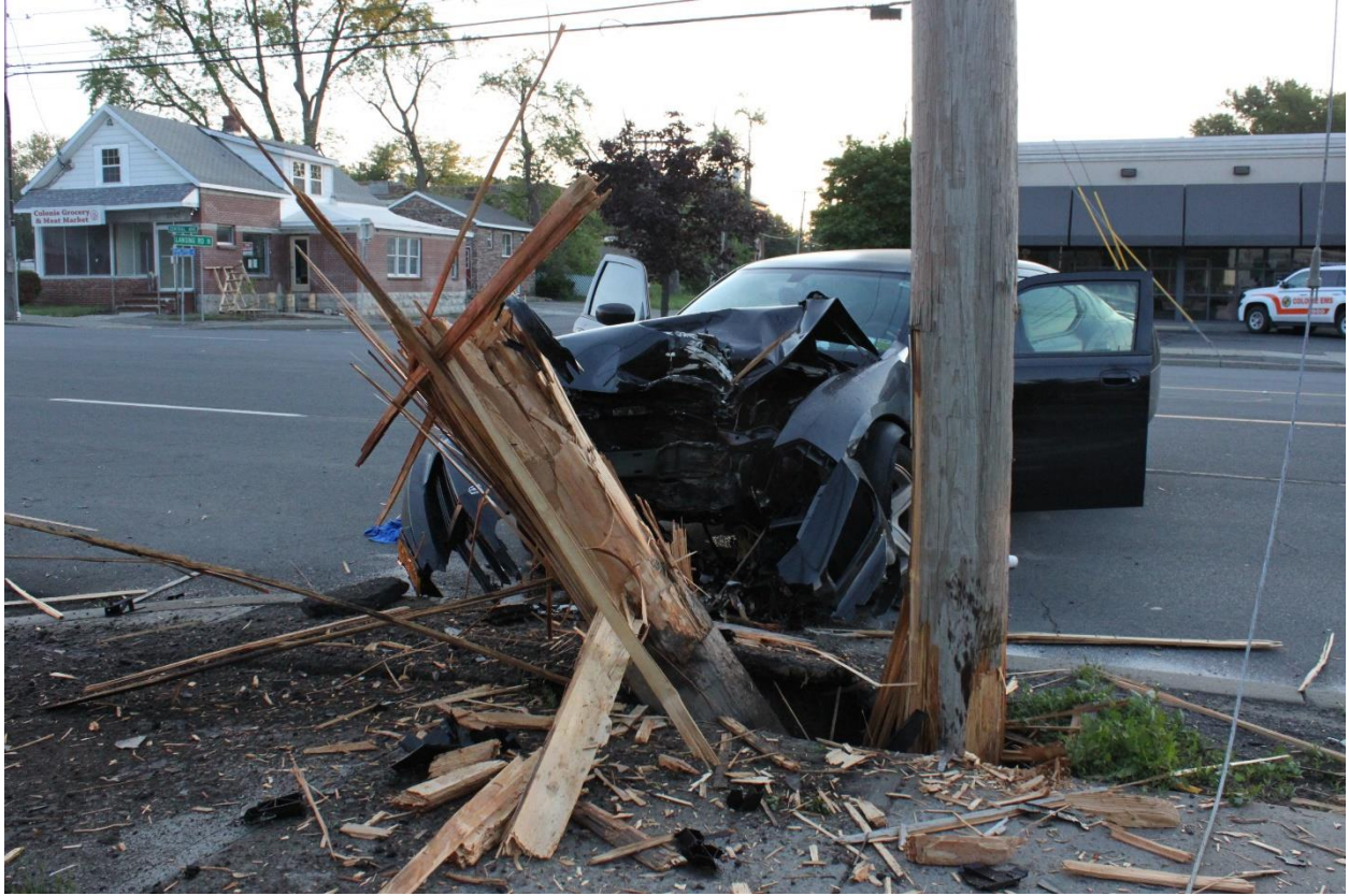
Crash Scene at Corner of Lansing Rd S and Central Avenue in Colonie on June 7, 2015