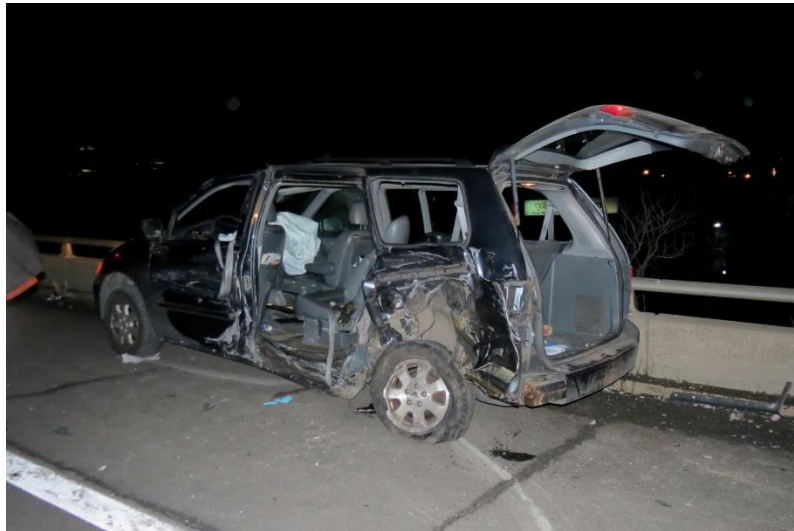
Minivan from Crash